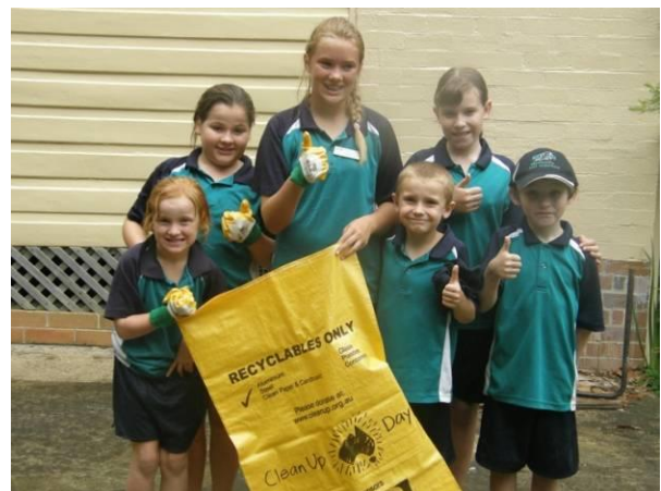
Clean Up Australia Day

Hérons Creek Public School will continue to provide a supportive, challenging learning environment for all of its students.