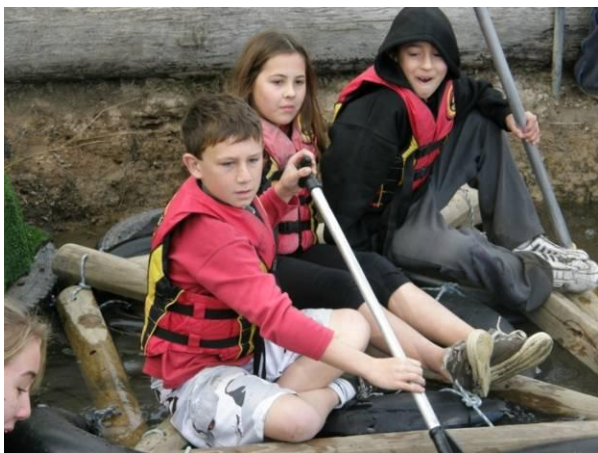
Students from 5/6 at Aussie Bush Camp