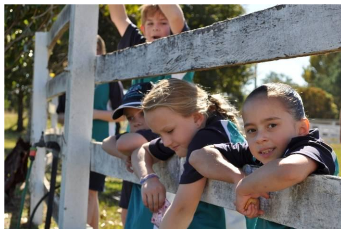
Students resting after Cross Country Carnival